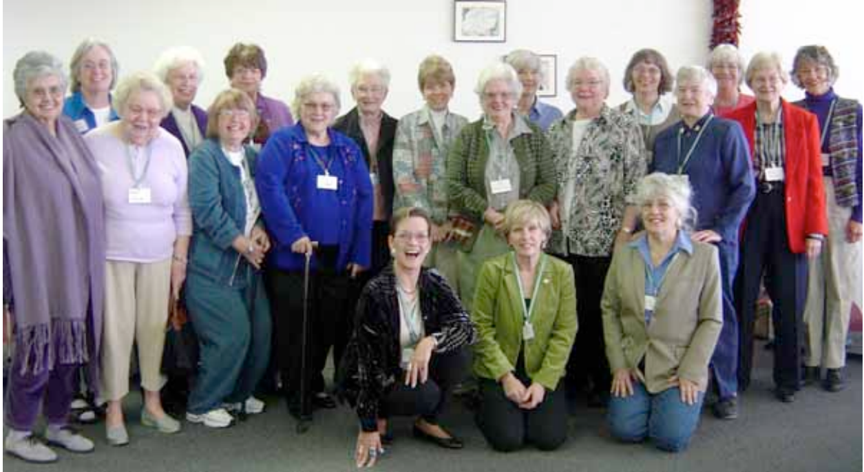
Serving the Western Communities of the Albuquerque Metropolitan Area

Through study, public policy advocacy, community involvement, and a variety of educational, cultural, and social activities, West Mesa Branch brings together college graduates in our community to promote the AAUW's mission and enhance members' lives.